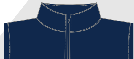
STAND UP COLLAR

All of our Midlayer ranges come with the option of having a stand up collar or a inverted collar.